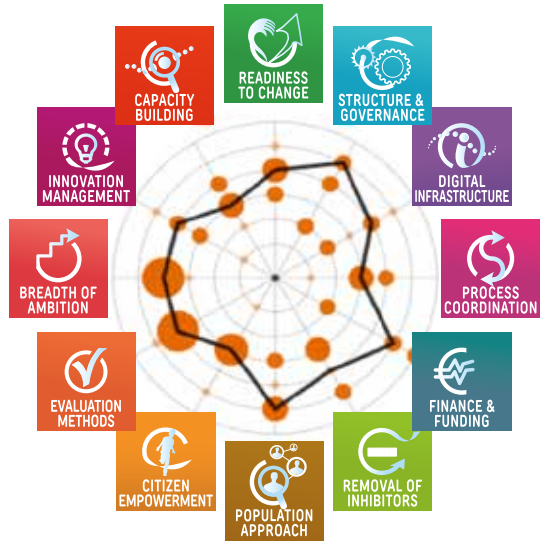
Group consensus-diagram for large-size Primary Healthcare Centres