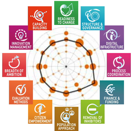
Group consensus-diagram for medium-size Primary Healthcare Centres