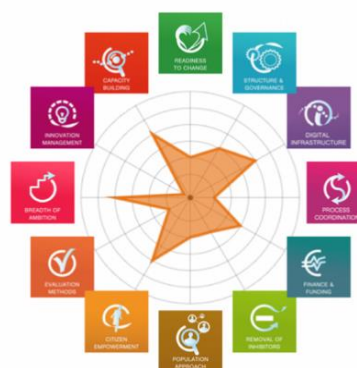
Maturity for integrated care in the Municipality of Trbovlje, Slovenia