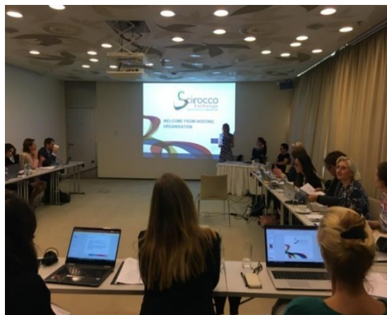
First project Assembly Kosice, Slovakia

It was wonderful to meet up with everyone at the Project Assembly in Kosice in Slovakia. The objective of this meeting was to review the progress of the project so far, in particular with regards to the activities on the maturity assessment and mapping of capacity-building assets. The meeting was also an opportunity to plan the next steps for the project such as upcoming knowledge transfer activities and further development of SCIROCCO Exchange Knowledge Management Hub. The Partners were also honoured to be invited by our Slovak colleagues from the PJ Safarik University to participate in and actively promote their integrated care initiatives at the international Conference on Chronic Diseases which took place on 24-25 October 2019.