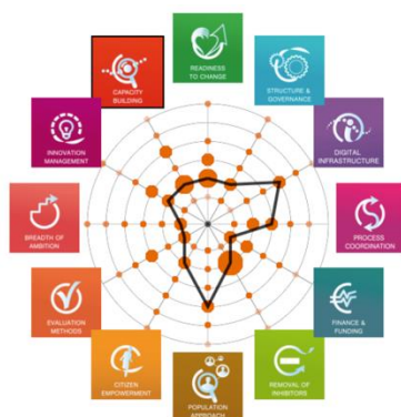
Maturity for integrated care in Lithuania

A lot has been happening across all the regions as the partners continue to undertake maturity assessments in their individual regions, which have been producing valuable insights on the readiness for integrated care. Over 150 stakeholders have so far participated in the assessment process providing their own reflections on the progress towards integrated care in their respective localities. The project partners are currently performing an overarching analysis on the current state of art in integrated care in 9 regions, including the identification of the needs and priority areas for improvement. The outcomes of the analysis as well as experience of regions on this process, lessons learned and next steps will be shared through the series of webinars starting from February 2020.