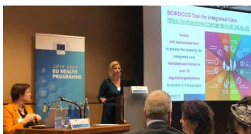
SCIROCCO Exchange dissemination activities

We are already thinking about submitting our abstract for the EUPHA 2020 Conference!