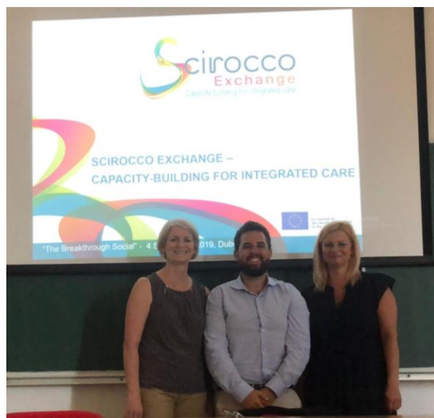
Re-thinking welfare, Dubrovnik, Croatia