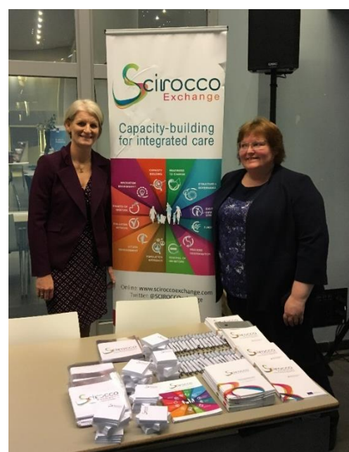
EU Health Programme Conference, Brussels