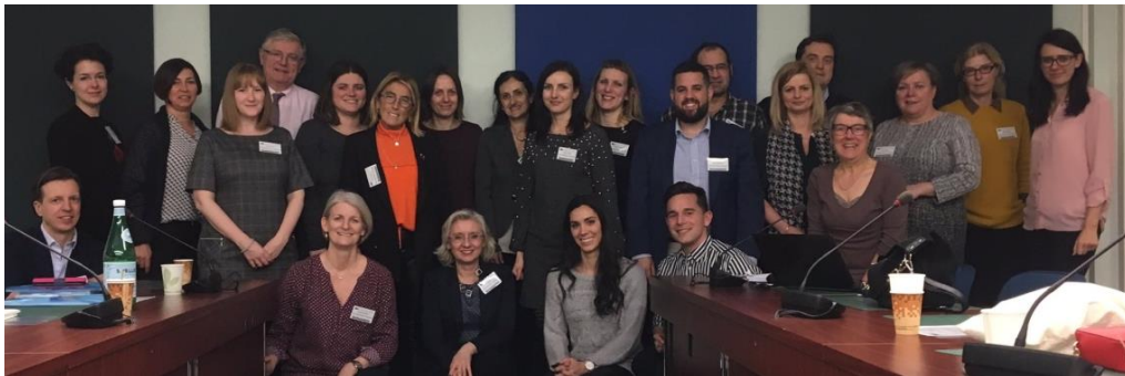
SCIROCCO Exchange Kick-Off Meeting 6 th -7 th February 2019

In the coming months the SCIROCCO Exchange partners will be developing effective collaborative interaction between Work Packages and contribute to the preparation of the project's dissemination materials and website. In addition to the development of the Knowledge Management Hub and Evaluation Framework, the self-assessments will be undertaken in 9 European regions for the maturity assessment for integrated care in these regions.