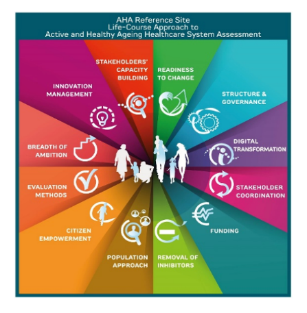
Figure 3: Expanded versions of SCIROCCO Exchange tool for integrated care