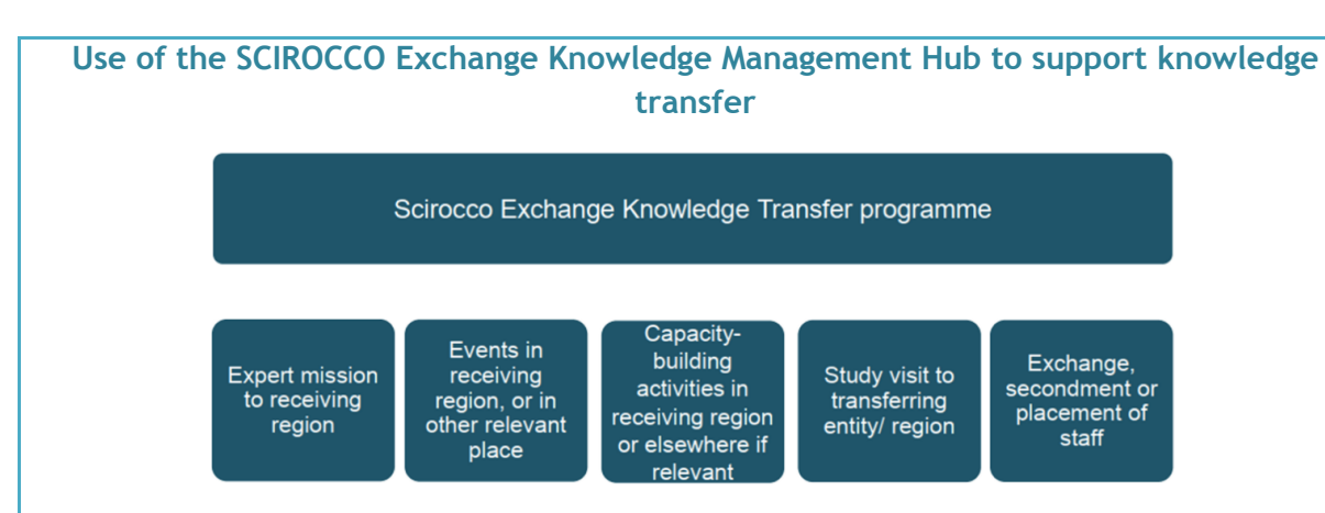
Figure 5: SCIROCCO Exchange Knowledge Management Hub