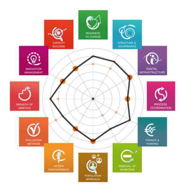
Figure 3: Maturity assessment in the Basque Country - Consensus-building

Use of SCIROCCO Exchange Knowledge Management Hub and its online selfassessment tool to assess maturity of healthcare systems