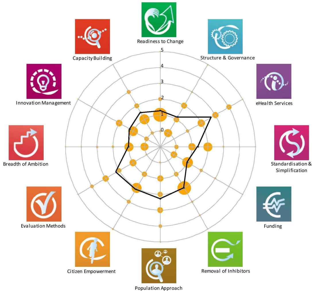
Figure 1 Spider graph representing means (dark line) and proportions (dots) of each response category, by dimension (dots are proportionate to the number of responses for each response category).

Management'; 'Capacity Building') and dimensions' means varying between a minimum of 1.0 (two dimensions: 'Funding'; 'Breath of Ambition') and a maximum of 2.7 (one dimension: 'eHealth Services') (see figure 1 and table 2 for details). As illustrated in figure 1 and table 3 , which show the distributions of the individual responses, the span of responses varied across dimensions. Whereas dimensions 6 ('Removal of Inhibitors') and 10 ('Breadth of Ambition') concentrated the majority of responses on two response modalities, all the other dimensions showed a spread of responses over three or four response modalities.