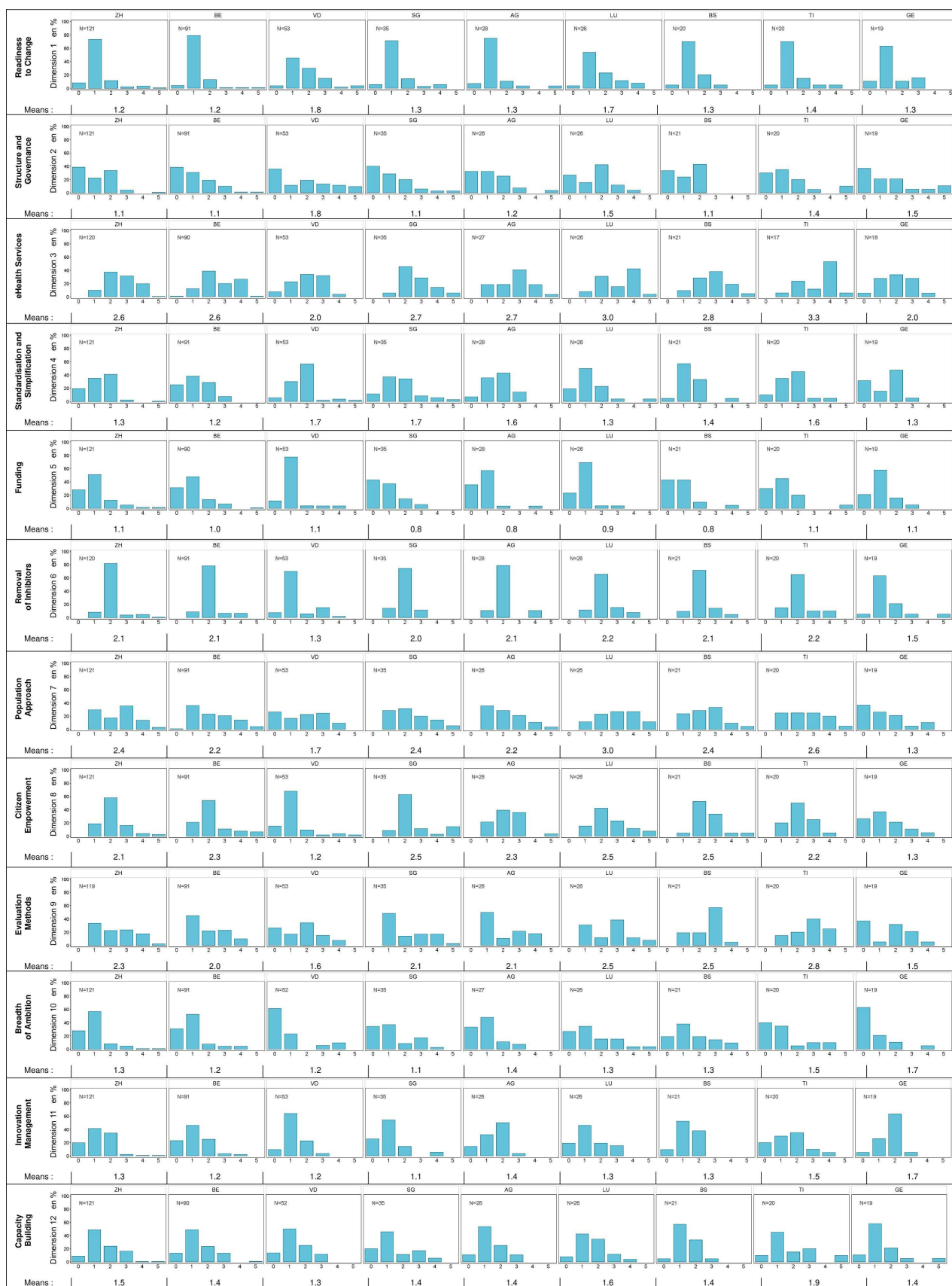
Figure 2 Histograms presenting, by dimension, the distribution of ratings of the nine cantons with the highest number of respondents. AG, Argovie; BE, Bern; BS, Basel; GE, Geneva; LU, Lucern; SG, St-Gall; TI, Ticino; VD, Vaud; ZH, Zurich.